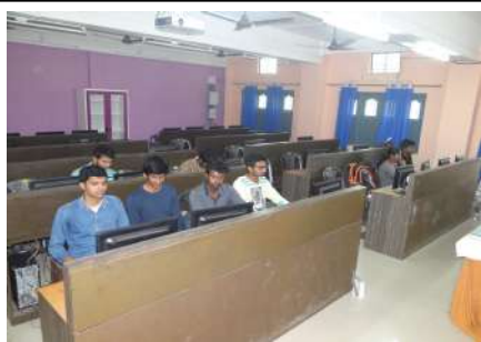
COMPUTER SCIENCE DEPT.