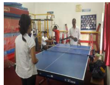
PHYSICAL EDUCATION DEPT.