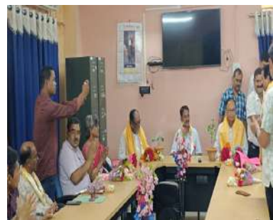
FELICITATION OF NEW G.B.